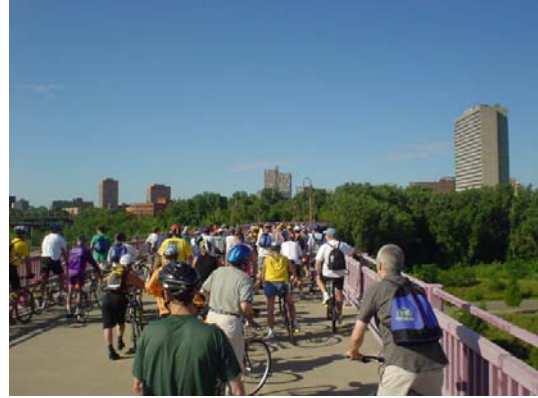
Participants in the Rails to Trails Trail Link Conference prepare to embark on a tour of Minneapolis' trails and greenways.

Trail Link 2005, the international trails and greenways conference sponsored by the Rails to Trails Conservancy ran from Thursday through Saturday morning, July 28 th – 30 th . The first morning was set aside for “Ride, Stride, and Glide”, your choice of biking, hiking or skating as the participants got on the trails. The Ride tour took participants through downtown Minneapolis, along the Hiawatha Light Rail line, on the Midtown Greenway, the Kenilworth Trail, back through downtown and over the Stone Arch Bridge. The sessions I attended as part of the Trail Link 2005 conference included “Making the Case for Parks and Trails,” and “Creative Corridors” Saturday morning began with a roundtable discussion on “Urban Trail Issues”. Afterwards, Congressman Oberstar addressed the participants and without a doubt, it was the highlight of the morning. I would like to thank the Mn/DOT Office of Transit and the SBAC for sponsoring me so I could attend these conferences. I was exposed to people and ideas that will serve me well in the years to come.